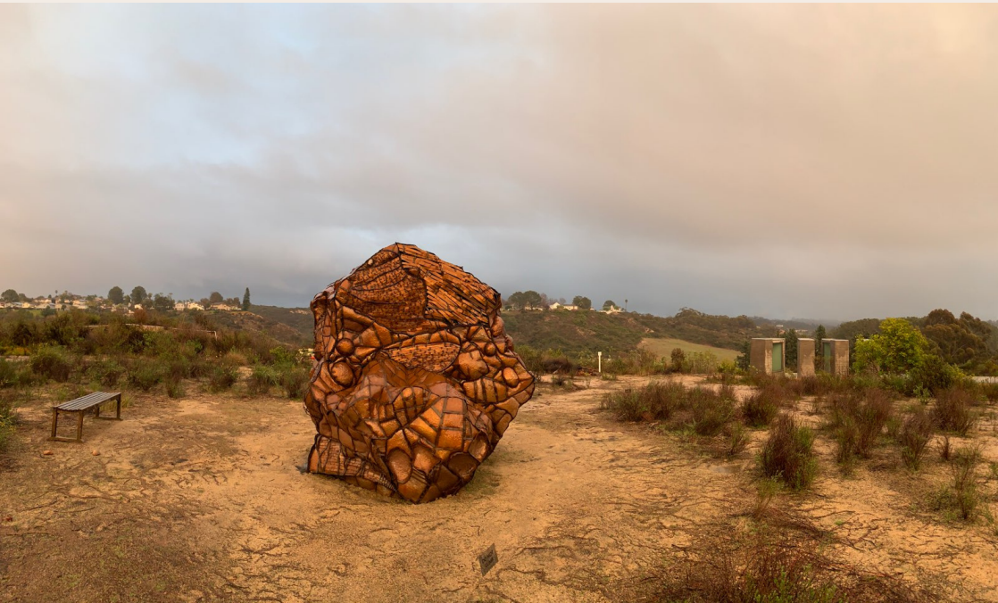
Beatriz Cortez, Glacial Erratic, 2020

DIALOGUES BETWEEN WESTERN AND NON- WESTERN (AFROCENTRIC, INDIGENOUS) CRITICAL THINKING TRADITIONS